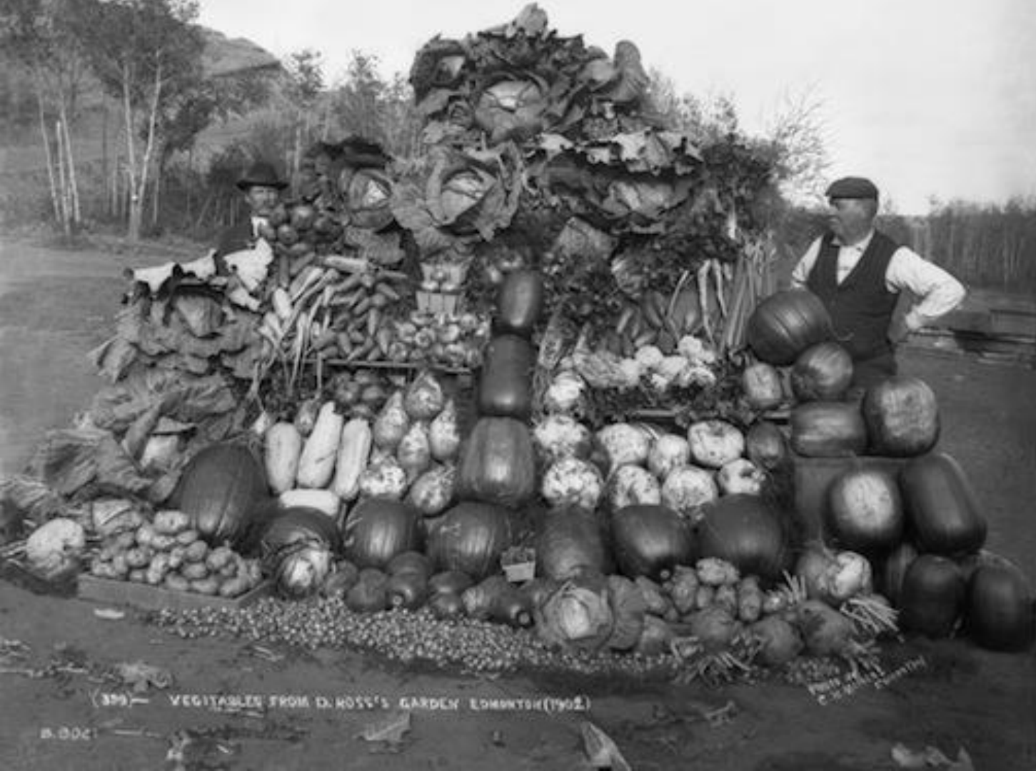
(399) — VEGITABLES FROM D. HOSS'S GARDEN EDMONTSH (1902).